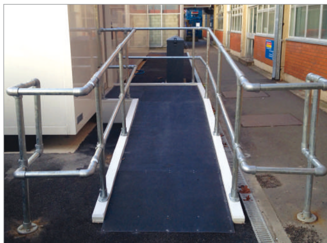
The anti-slip solution for gangways and access ramps.

For prices, a free sample or to buy online visit: www.SafeTread.co.uk or call 01206 227 660 to speak to our specialist team.