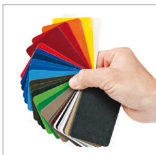
Custom: any BS/RAL colour

For prices, a free sample or to buy online visit: www.SafeTread.co.uk or call 01206 227 660 to speak to our specialist team.