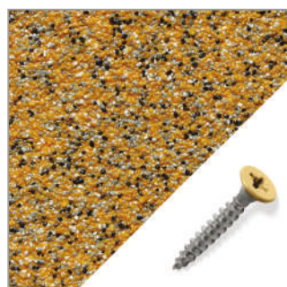
Harvest + buff screws