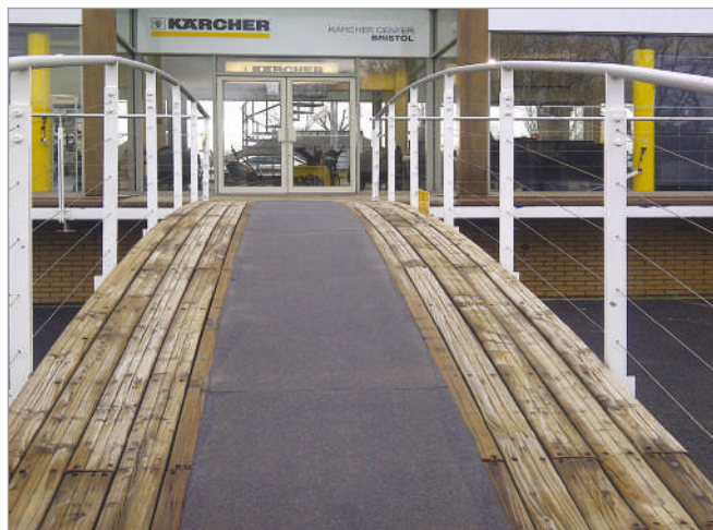
Commercial footbridges and public paths.