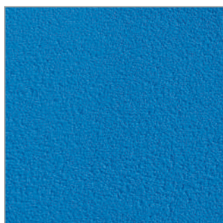
Blue RAL 5015