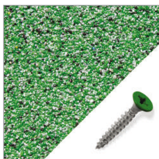
Hillside + green screws