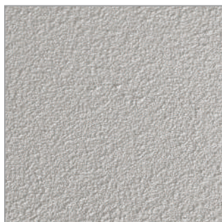
Light grey RAL 7035