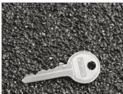
Coarse Grit particle size: 1.7mm