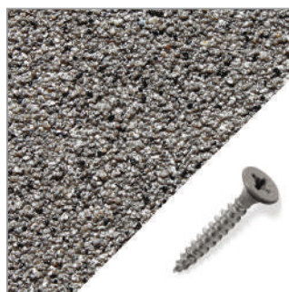
Gunmetal + medium grey screw