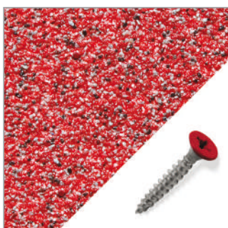
Vineyard + red screws

For prices, a free sample or to buy online visit: www.SafeTread.co.uk or call 01206 227 660 to speak to our specialist team.