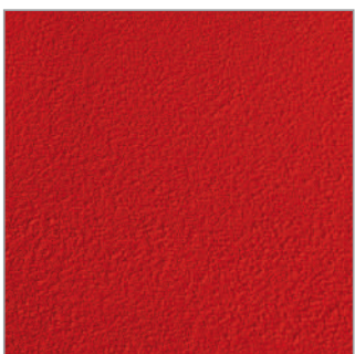
Red RAL 3950