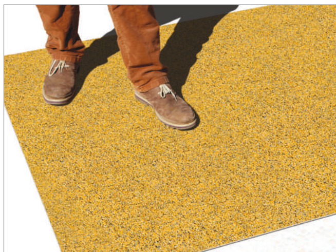
Non-Slip Floor Sheets Colourdec blended colour range.

Tested anti-slip to BS7976.2 and rated low slip potential.