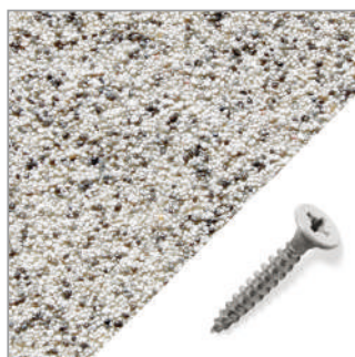
Barn owl + light grey screw