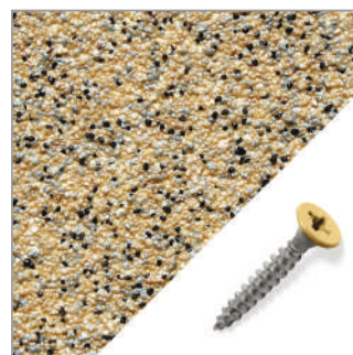
Dune + buff screws