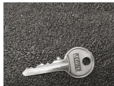
Fine Grit particle size: 0.5mm