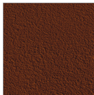
Brown RAL 8028