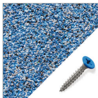
Bayside + blue screws