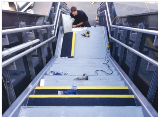
School stairway installation in progress.