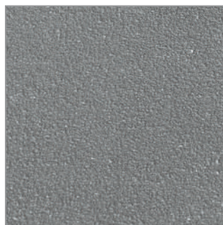
Medium grey RAL 7004