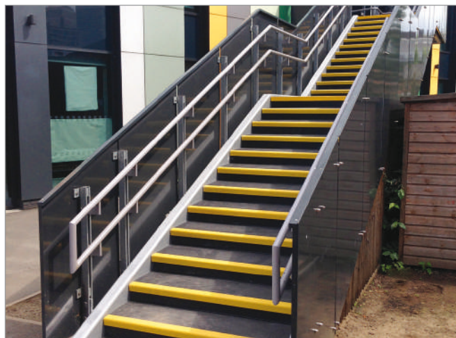
DDA compliant treads applied to stairs and landing areas.