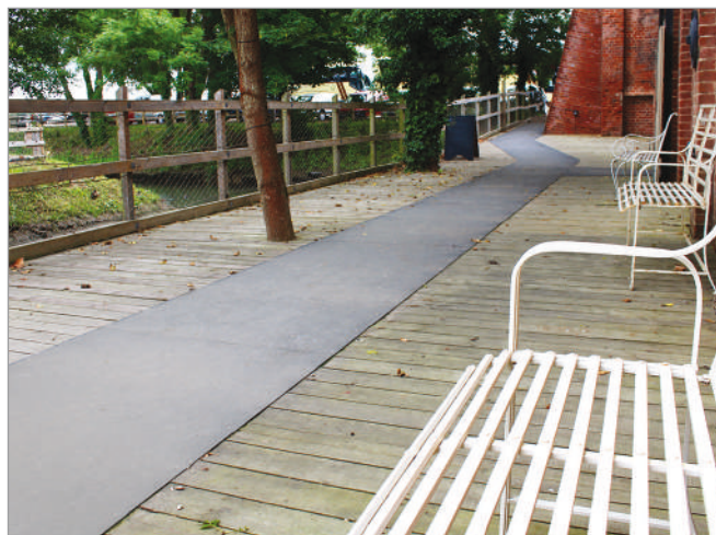
Ideal for slippery timber decking, paths and public walkways.

A fitting service available if required.