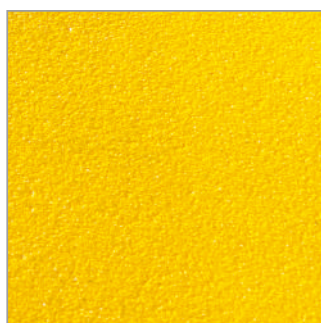
Yellow RAL 1003