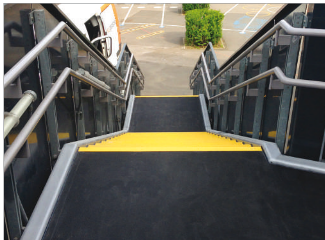
Stairs, ramps and walkways installation completed.

For prices, a free sample or to buy online visit: www.SafeTread.co.uk or call 01206 227 660 to speak to our specialist team.