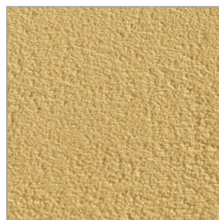
Beige RAL 1001