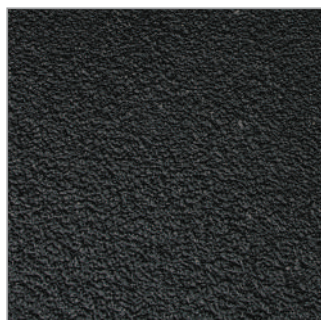
Black RAL 9004