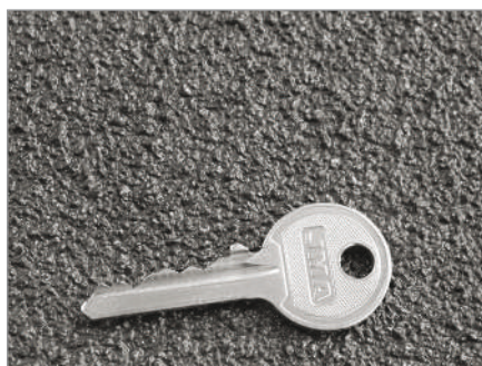
Medium Grit particle size: 1.0mm