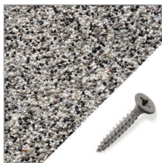
Wizard + medium grey screw