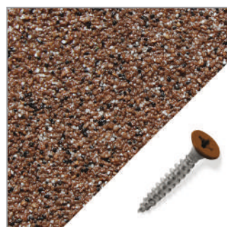
Woodland + brown screws