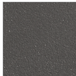
Dark grey RAL 7015