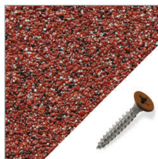
Rustic + brown screws